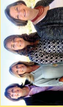
Follow the Adult School & Parent Participation

Our mission is to meet the diverse educational needs of our community by empowering lifelong learners to reach their professional, personal and family goals. We build community by helping adults receive their high school diplomas, learn English, find parenting support, stay fit, and learn something new. If you or someone you know needs financial support to take one of our classes, please call the Adult School office to inquire about our scholarship program. Thank you for taking our classes, and allowing us to serve you! -The Office Team